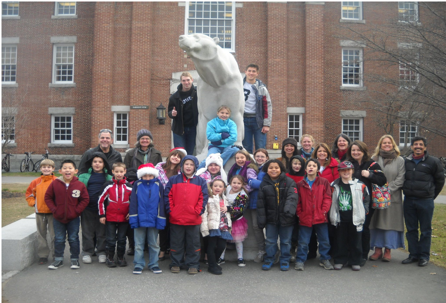
Mast Landing School