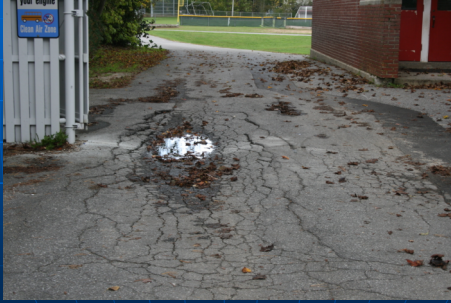
Resurface Morse Street Bus Road